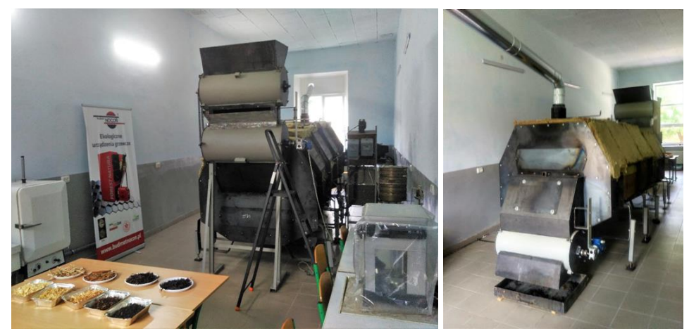
Fig. 1. General view of the biomass torrefaction installation (in laboratory "DAK GPS")

It continues the work on the scientific topic "Agrobiomass of Ukraine as an energy potential of Central and Eastern Europe" (registration number 0119U103056) at the State Agrarian and Engineering University in Podilia, the joint Ukrainian-Polish educational and scientific laboratory "DAK GPS" [23-27]. The main activity of the laboratory is to improve the energy performance of biomass by thermal treatment (torrefaction), which results in torrefied product. Investigations of the primary signs of the state of heat-treated raw materials were carried out on a plant for torrefaction of tape-type biomass with passive interaction with the material (Fig.1). This method minimizes the physical and mechanical effects on the raw material, and the flow of the process allows to get the most homogeneously processed product. Control automatics allow to adjust and maintain the temperature in the thermal chamber, as well as the speed of movement of the tape, which determines the residence time of the biomass under the influence of thermal action.