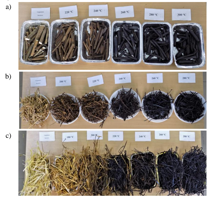
Fig. 2. Change in the colour of biomass depending on the temperature of torrefaction: a – Jerusalem artichoke, b – soybean (chaff), c – barley (straw)

In addition, as a result of the research, some pattern of colour change of biomass, which is subjected to thermal treatment was noticed. The colour of the feedstock is an intuitive indicator that changes when the feedstock is thermally degraded [31]. The colour change of biomass depends on the conditions of torrefaction. It has been found that the colour change of biomass from brown to black occurs at the temperature range of 150-300 °C [32]. This primarily results from the changes in the chemical composition after torrefaction. The colour range of samples prepared at different temperatures also has its own characteristics. In most cases, there were two characteristic changes in colour. At low temperatures, characteristic mainly for the first stage of thermal treatment (Fig. 2), there is a slight change in colour towards darkening, or there is a characteristic shade. At temperatures, corresponding to the beginning of a sharp increase in the weight loss, brown-black tones appear in the samples, until they acquire a charcoal colour (Fig. 3). Since these changes correspond quite accurately to the stages described above on the curves of the weight loss, we can conclude that colour is another promising area for determining the parameters of thermal treatment of biomass.